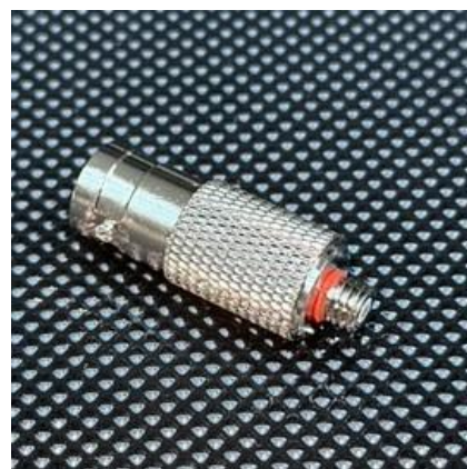
Dimensions in mm

The 10/32UNF Microdot to BNC socket joiner is a compact and high-quality joiner widely used in data acquisition and sensor measurement applications.