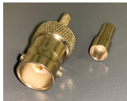
Dimensions in mm

The KBNC-S is a high-quality BNC crimp socket for RG174 cable